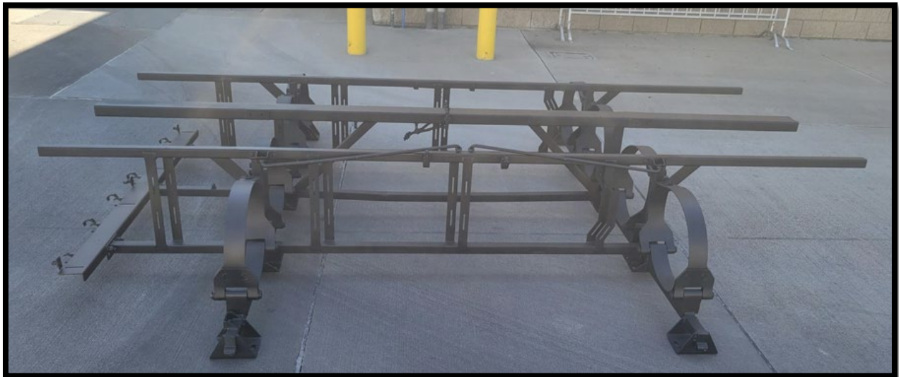
CNG Fuel Tank Cradles

Referential picture of two (2) fuel tank cradles from one (1) bus that will hold seven (7) CNG fuel tanks.