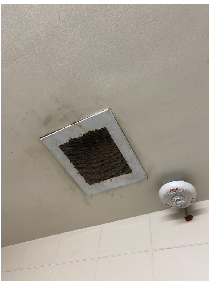
Typical Ceiling Mounted Exhaust Fan Unit at Men's and Women's Restroom