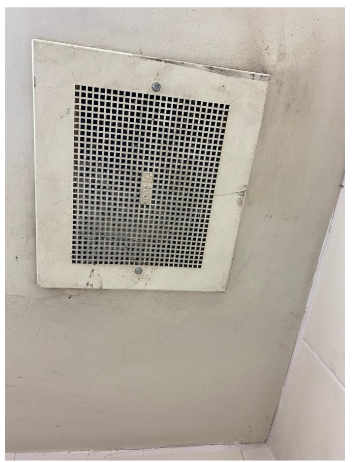
ATTACHMENT C – PHOTOS OF EXISTING CEILING MOUNTED EXHAUST FAN UNITS