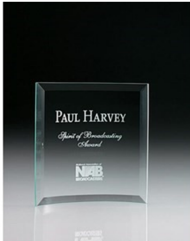
Jade Scroll Award – Large or Approved Equal Style #: 103500-35260