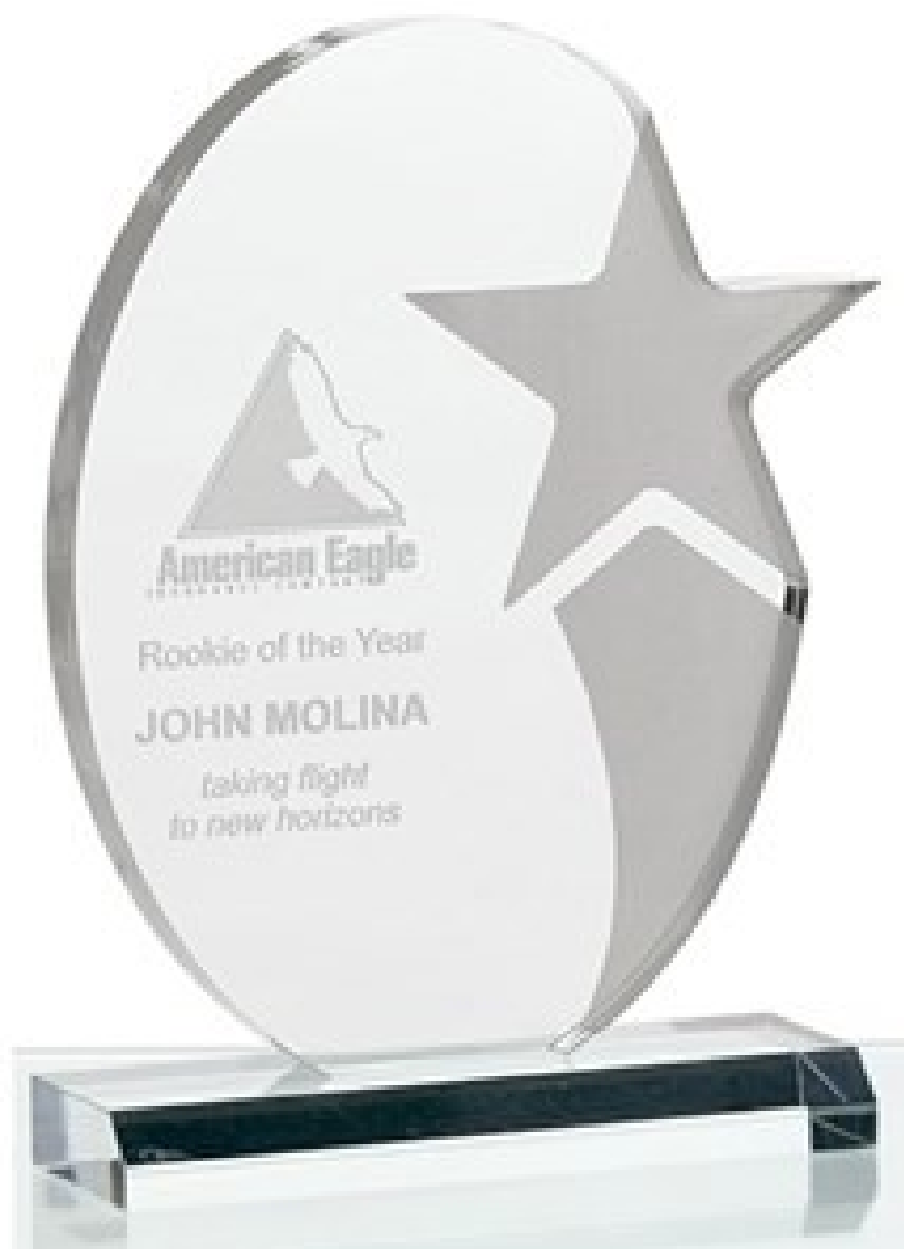
Stellar Award or Approved Equal Style #: 103500-36420