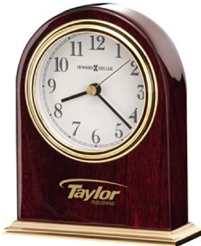
Howard Miller Monroe Rosewood Arch Clock or Approved Equal Style #: 20304-645-446