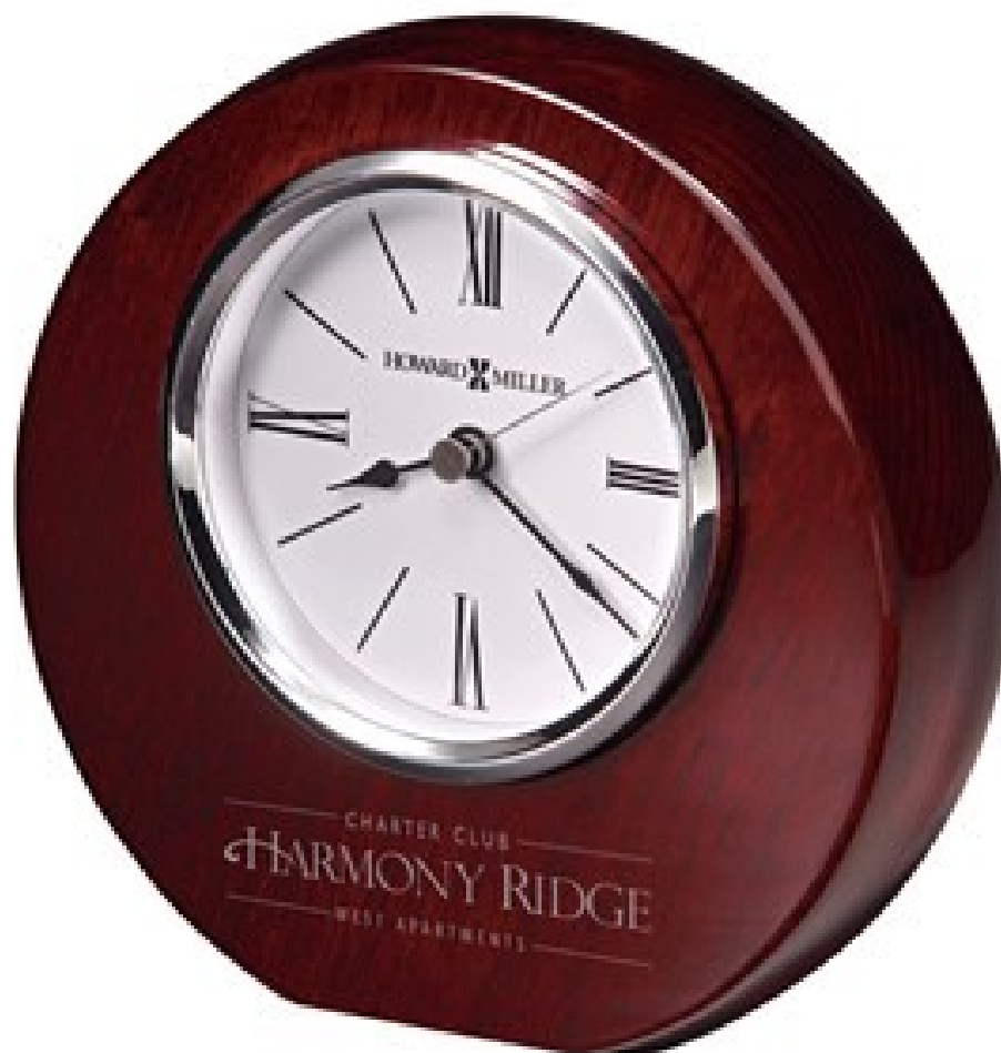
Howard Miller Adonis Round Rosewood Clock or Approved Equal Style #: 20304-645-708